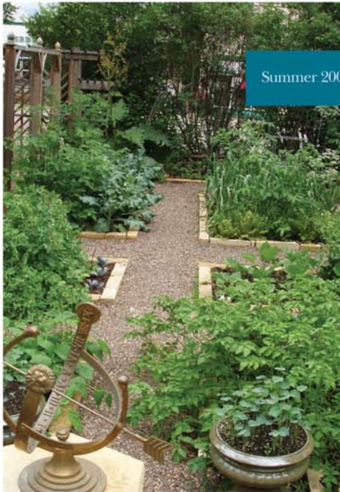
Summer 2009 | Fall 2009