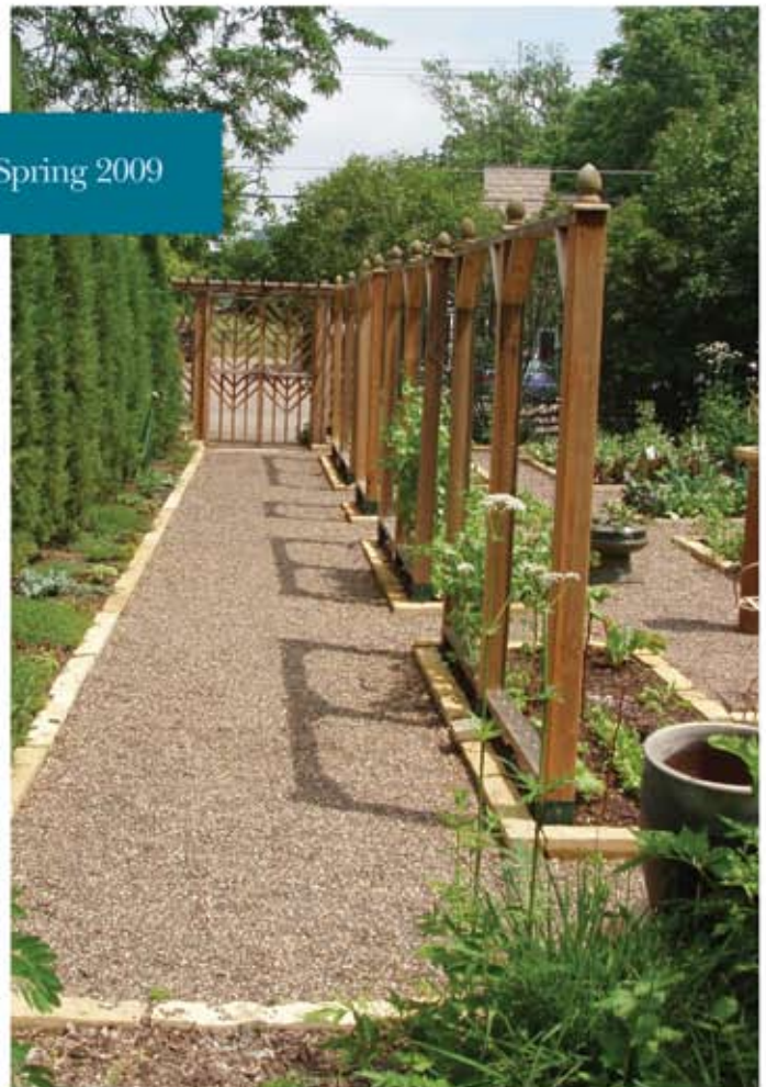
August 2008: The sundial provides a focal point for the garden in all seasons. Plants such as kale and chard add color and texture.