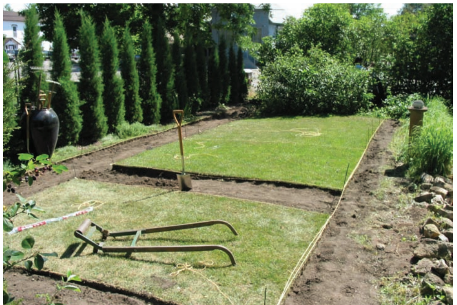
After determining bed and path sizes, use a sod-kicker to remove grass.

Formal garden style found its fullest expression in 17th-century France but was embraced by many in Europe, especially the English. Gardens (called parterres ) of inconceivable scale, intricate ornamentation, and complex geometry were created for royalty. More modest forms of this style of garden were, and still are, created with the shared characteristics of being garden constructions on a level surface consisting of planting beds, edged in stone or tightly